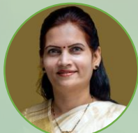
Dr. BHARATI PRAVIN PAWAR Hon'ble Minister of State for Health & Family Welfare