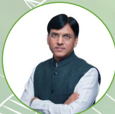
Dr. MANSUKH MANDAVIYA Hon'ble Union Minister of Health & Family Welfare and Chemicals & Fertilizers